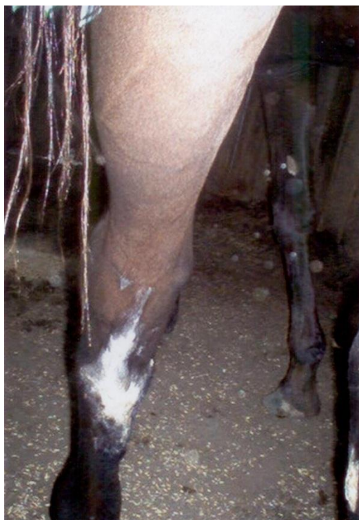
After Stem Equine